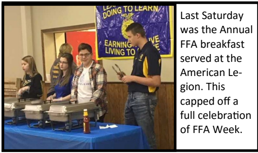
Last Saturday was the Annual FFA breakfast served at the American Legion. This capped off a full celebration of FFA Week.